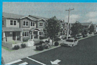
Millennium Homes: Located in Long Beach's Washington Neighborhood, this ten-home development is also the site of Habitat LA's 1,001st home. This development will be completed in Spring of 2022.