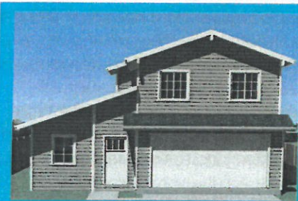
94th Street: This two-home development in Los Angeles County will be completed in January 2022.

With Los Angeles County ranked as one of the nation's least affordable housing markets in the United States, owning a home may seem next to impossible for many local families. That's why Habitat LA partners with first-time homebuyers to purchase homes with affordable mortgages—in fact, Habitat LA is the only organization dedicated to providing opportunities for limited income families to enter the market. This year, 17 Habitat LA partner families will become first-time homeowners. Habitat LA strives to continue making affordable homeownership opportunities available throughout greater Los Angeles and the following are a few of developments currently under construction or in pre-development.